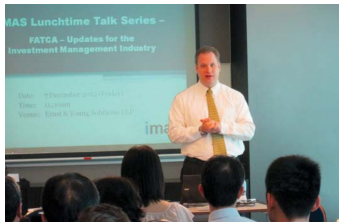
FATCA – Updates for the Investment Management Industry

In August 2012, IMAS provided inputs to the Monetary Authority of Singapore (“MAS”) Manpower Initiatives on “Developing Pipeline of Specialised Talent and Leaders Amongst Singaporeans”. To align with the revised Code of Corporate Governance issued by the MAS in May 2012, the Committee also reviewed and updated the IMAS Guidelines on Corporate Governance in October 2012, which sets out key guiding principles for IMAS members to include updated corporate governance approaches in their individual firms. Additionally, the Committee is heavily involved in helping the industry navigate through the challenges of the US Foreign Account Tax Compliance Act (“FATCA”). Besides organising educational talks on FATCA, the Committee participated actively on the FATCA Private Sector Advisory Panel, providing significant inputs to the MAS and the Ministry of Finance in their intended negotiations with the US Treasury on an intergovernmental agreement for FATCA.