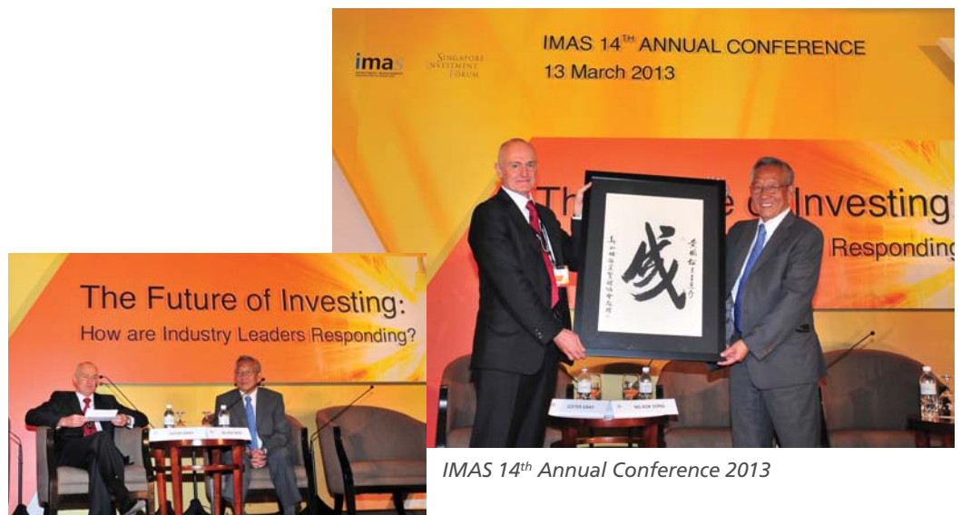
IMAS 14 th Annual Conference 2013