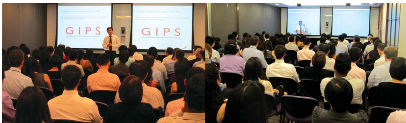
GIPS for Asset Owners

Going forward, the Committee will strengthen its engagement with industry practitioners relating to risk and performance issues, and provide a platform for greater collaboration and debate among investment managers on relevant industry concerns.