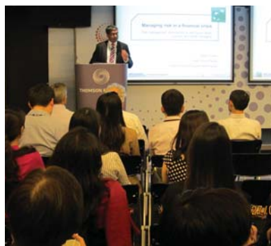
Escalation of the European Crisis?