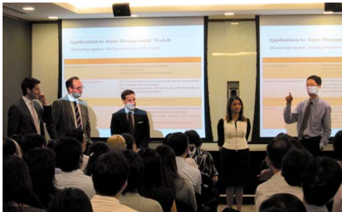
IMAS Lunchtime Talk Series - Tax Crimes & Money Laundering

IMAS is committed to providing an educational platform for professionals in the industry to upgrade their knowledge and skills. Our collaboration with the Nanyang Polytechnic on its Certificate in Fund Administration and Specialist Diploma in Fund Management & Administration courses continues to be an important pillar in that effort.