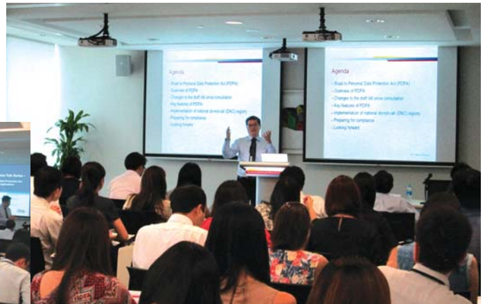
The Personal Data Protection Act and Its Implications